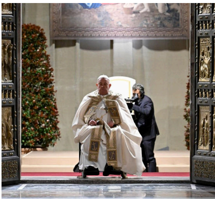
Pope Francis at the threshold of the opened Holy Door of Saint Peter's Basilica

At the heart of the Jubilee is an invitation: to return to God with open hearts, seek reconciliation, and renew our commitment to love and justice. It's a reminder that God is always ready to give us a fresh start.