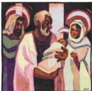
The Holy Family Illustration